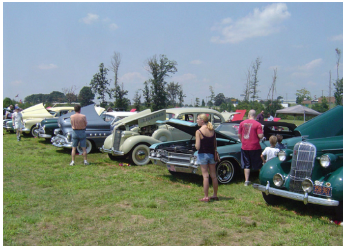
Buicks at August Monthly meeting at General Greene AACA show at the Greensboro Farmers Market.