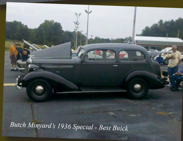
Butch Minyard's 1936 Special - Best Buick