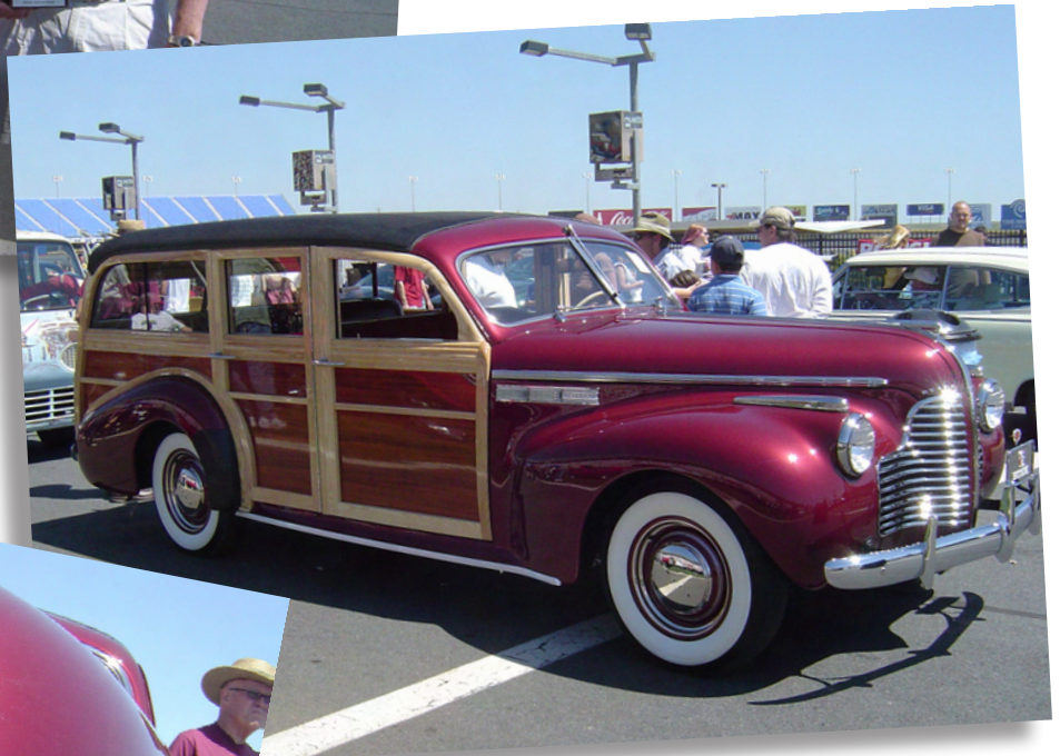
Doug's 1940 Super Woody Wagon in Victory Lane