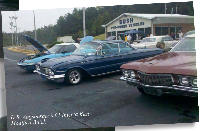
D.R. Augsburger's 61 Invicta Best Modified Buick