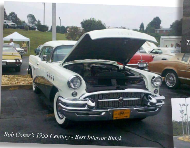
Bob Coker's 1955 Century - Best Interior Buick