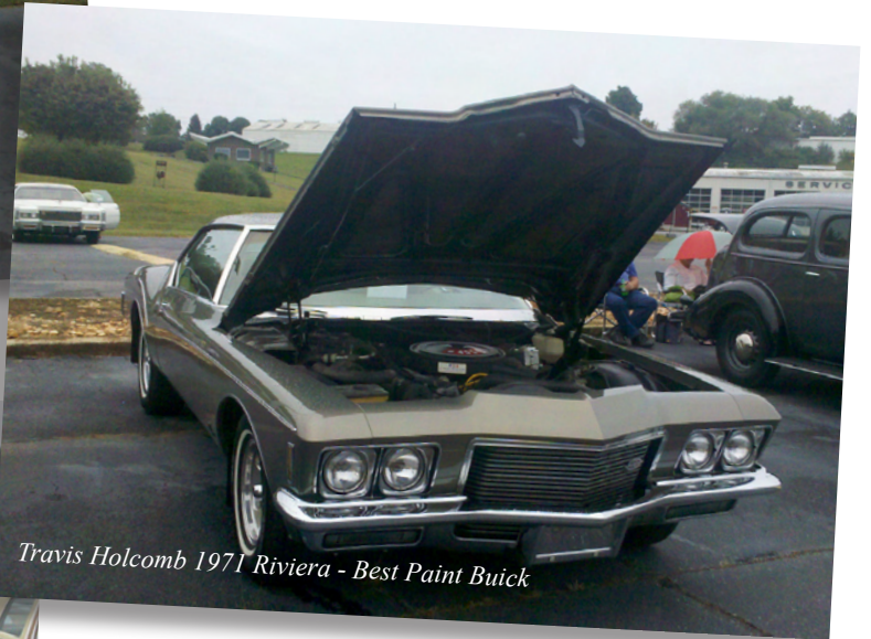
Travis Holcomb 1971 Riviera - Best Paint Buick